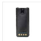
Li-polymer battery 2400mAh