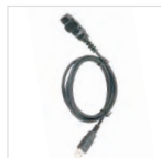
Programming cable (USB port)