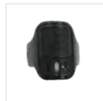
BT Wireless ring PTT