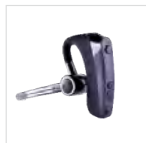
BT Wireless earpiece